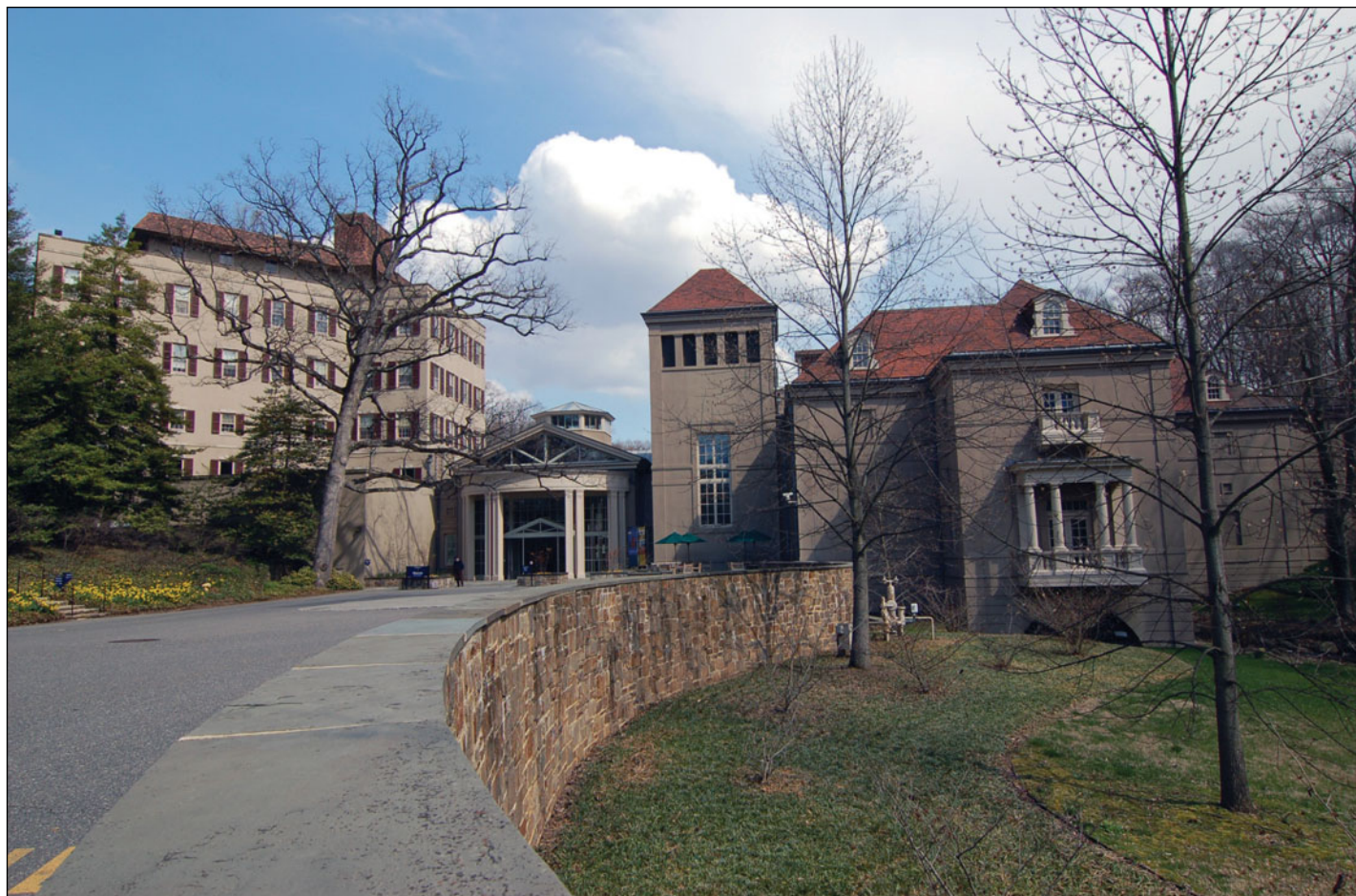
Figure 2. Winterthur Museum entrance.