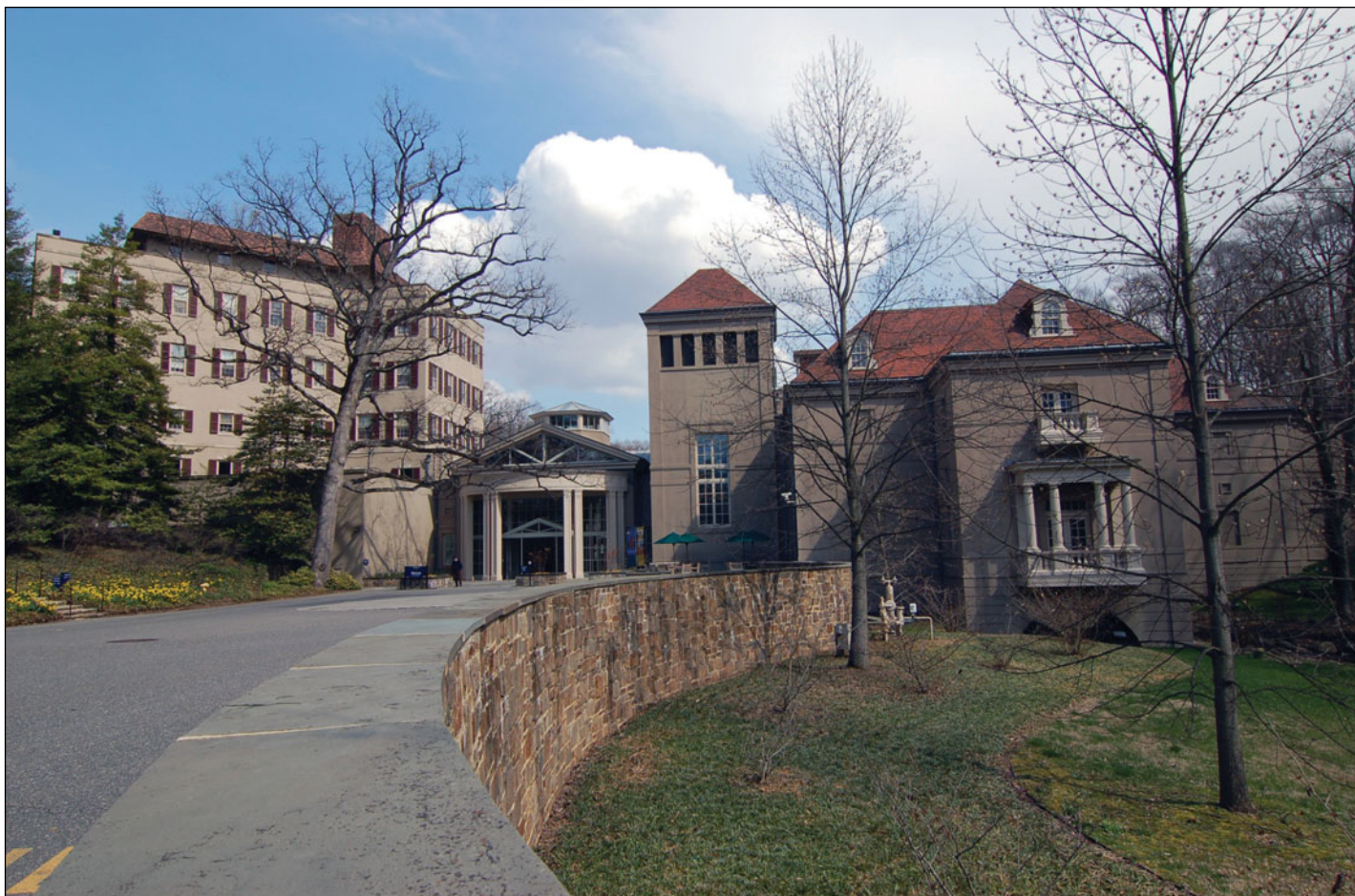
Figure 2. Winterthur Museum entrance.