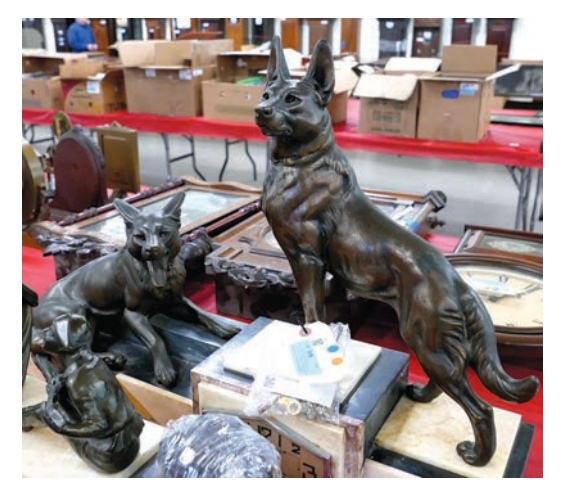
We hope that a dog lover ended up with this French marble Art Deco mantel clock topped by a pair of cast metal German shepherds. Included with a clock garniture set, it sold for $531 (est. $400/600).

This may look like a familiar wall regulator, but it is not. Circa 1930, this "Master Clock Type B" was manufactured by Warren Telechron Co. in Ashland, Massachusetts, to hang in electricity-generating stations to help keep the AC current steady at 60 cycles. Otherwise, all the Telechron clocks in homes and businesses would be fast or slow. I have one of these on my own wall, so I was happy to see it sell strongly for $1652 (est. $900/1200).