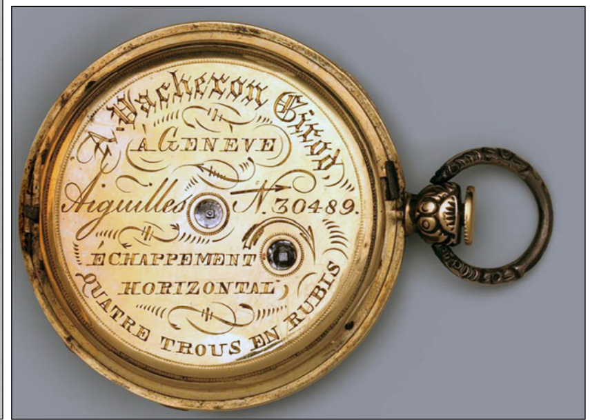
Figure 4. The rear cover of this 1832 pocket watch by Abraham Vacheron Girod provides details about what is inside. Many nineteenth-century Swiss watches had similar engraved information noting, as this does, the tiny drilled jewels used as low-friction bearings. The Swiss firm Vacheron & Constantin still produces fine watches.

The gallery has limited wall space, so only a small group of longcase clocks are shown. At least one longcase is kept running: the circa 1680-1685 walnut veneered British example by Joseph Knibb. A nearby video shows the clock being wound. Another longcase clock usually stands in the adjacent galleries of the Jack and Belle Linsky Collection. Ferdinand Berthoud's astronomical regulator, circa 1768-1770, is an outstanding example of that famous French maker's output. Moved to a spot under bright lights, Sul-