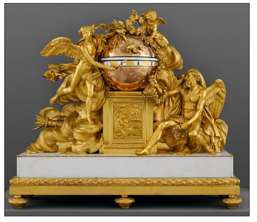
NAWCC Watch & Clock Bulletin · March/April 2016 · 179

Figure 1. The centerpiece of the exhibit, this gilt-bronze, marble, and enamel mantel clock weighs nearly 400 pounds and is more than 3" across. Father Time clearly was dejected in this depiction of eternal love's triumph over him. The arrow tip points to the minutes and hours on an annular dial.